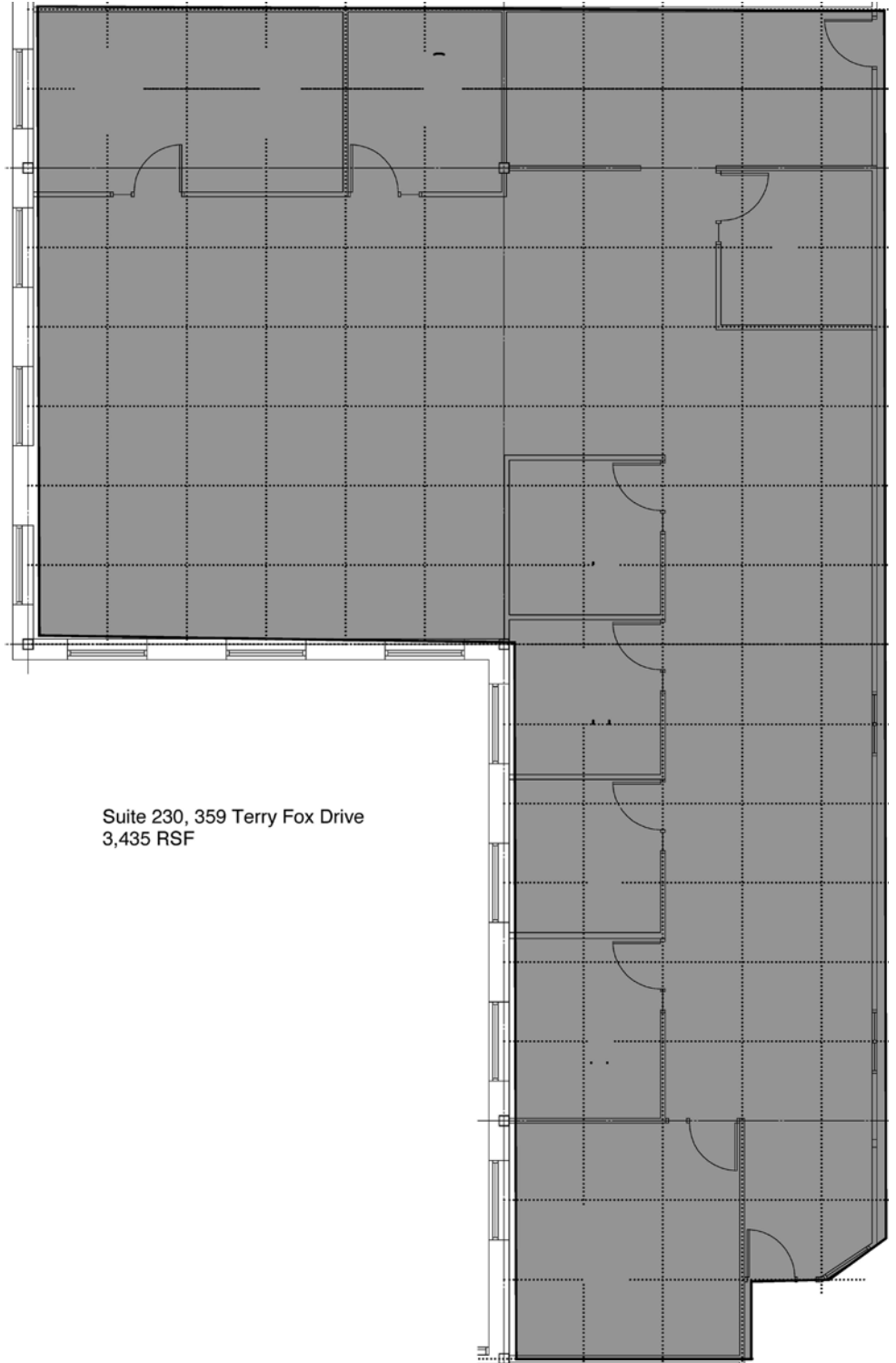
Suite 230, 359 Terry Fox Drive 3,435 RSF